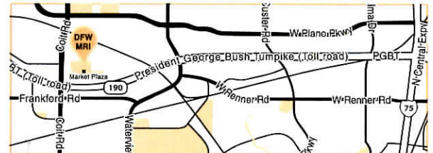
In Market Plaza Shopping Center