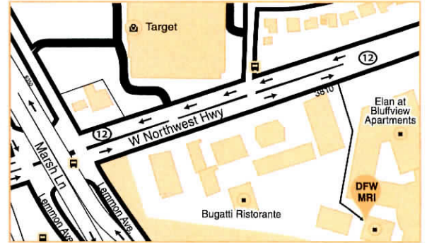
Behind the Shops at Bluffview Apartments & Across the parking lot from Bugatti Ristorante