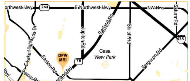
2-1/2 miles south of I-635 on Garland Road NW Corner of Garland Road and Easton Road